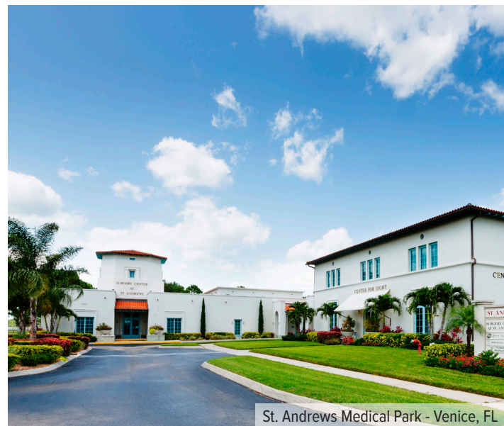
St. Andrews Medical Park - Venice, FL