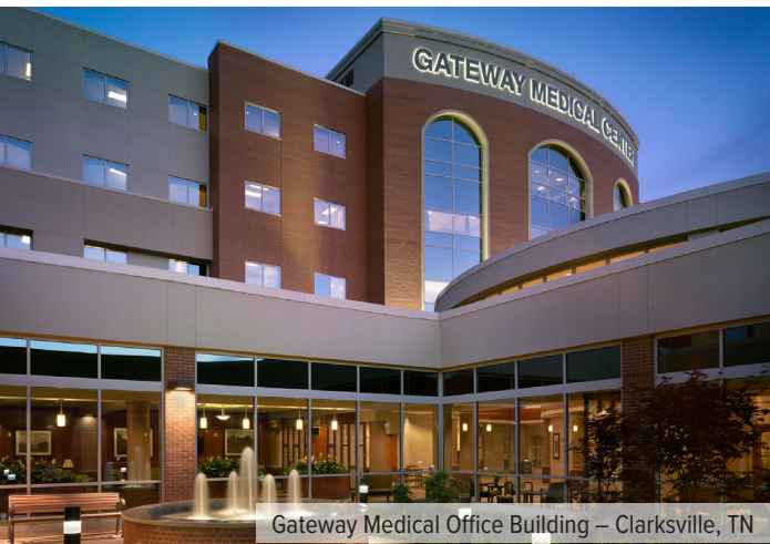
Gateway Medical Office Building – Clarksville, TN