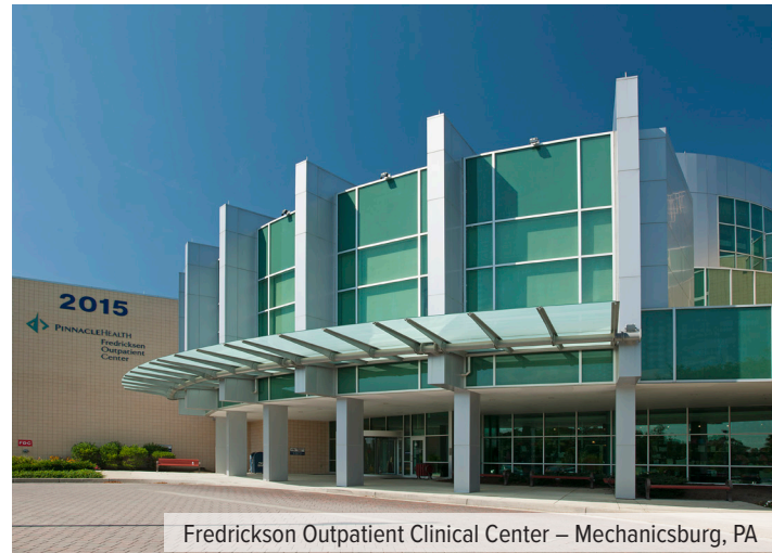
Fredrickson Outpatient Clinical Center – Mechanicsburg, PA