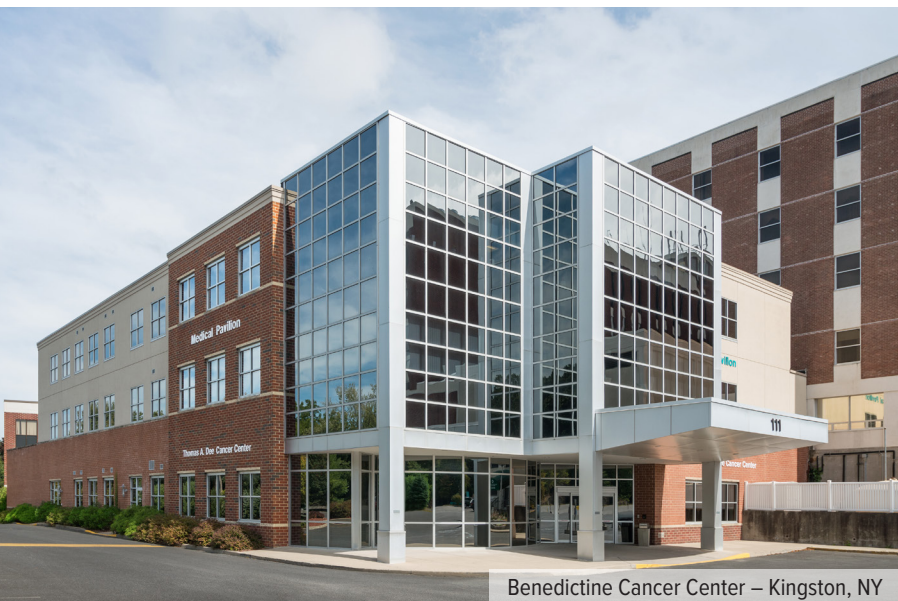
Benedictine Cancer Center – Kingston, NY