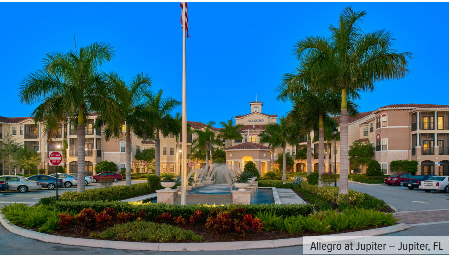
Allegro at Jupiter – Jupiter, FL