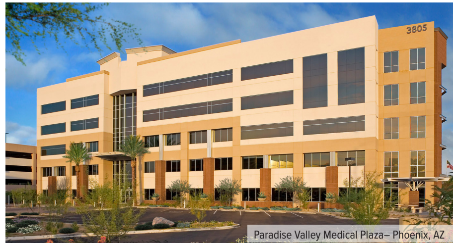
Paradise Valley Medical Plaza – Phoenix, AZ